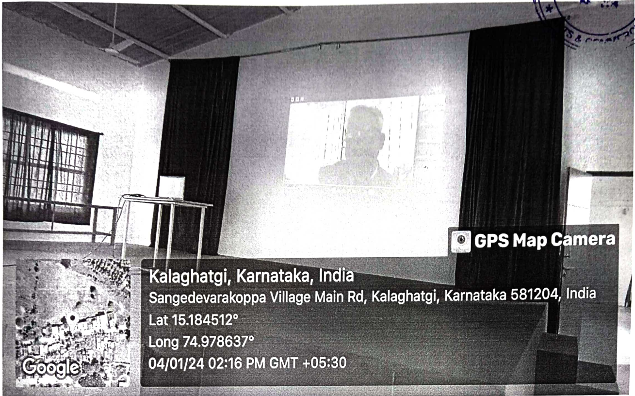
Lecture by the resource person