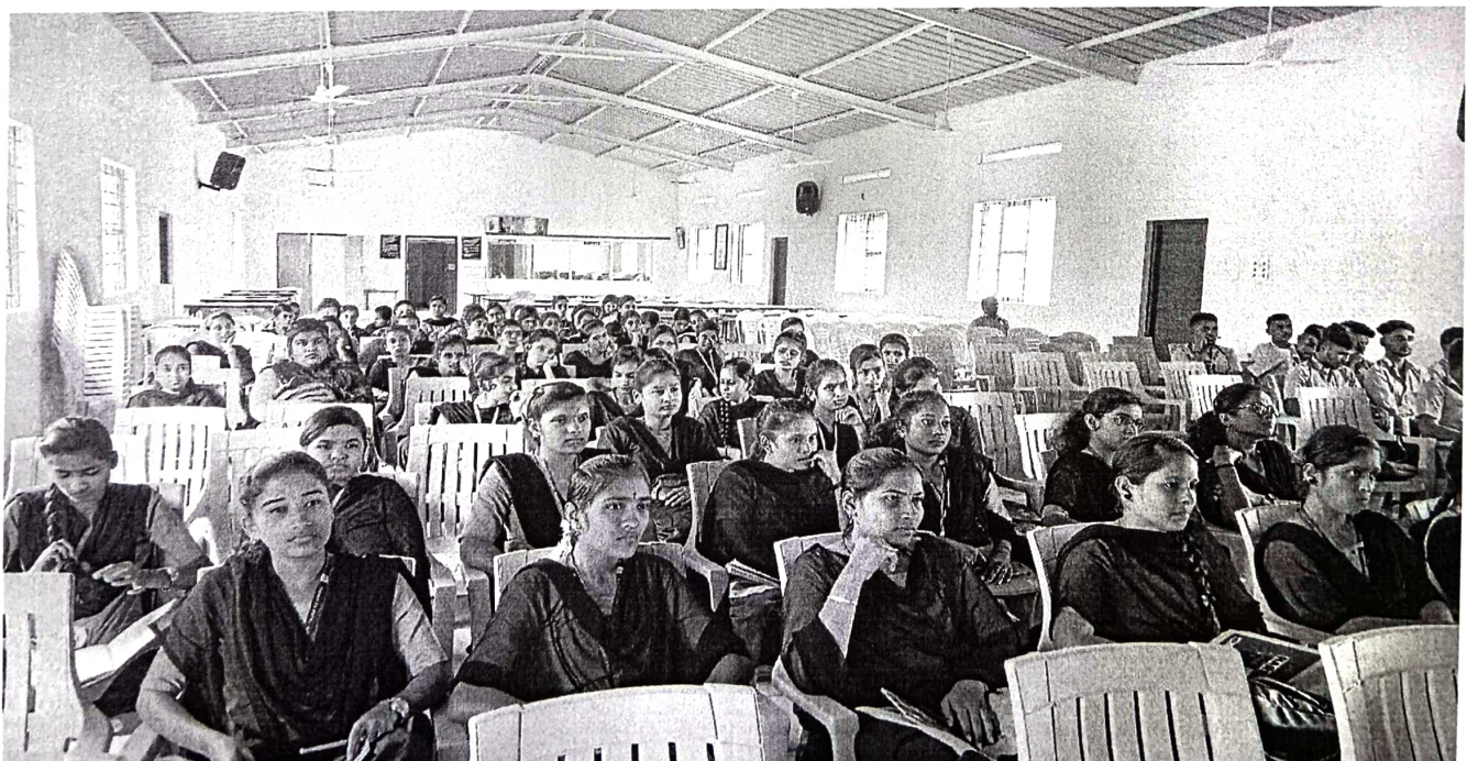
Students involvement in the session