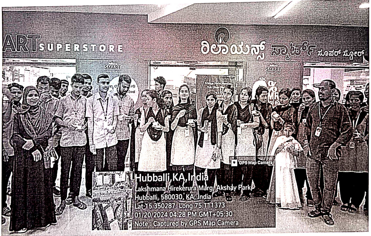
Inside of the Retail store