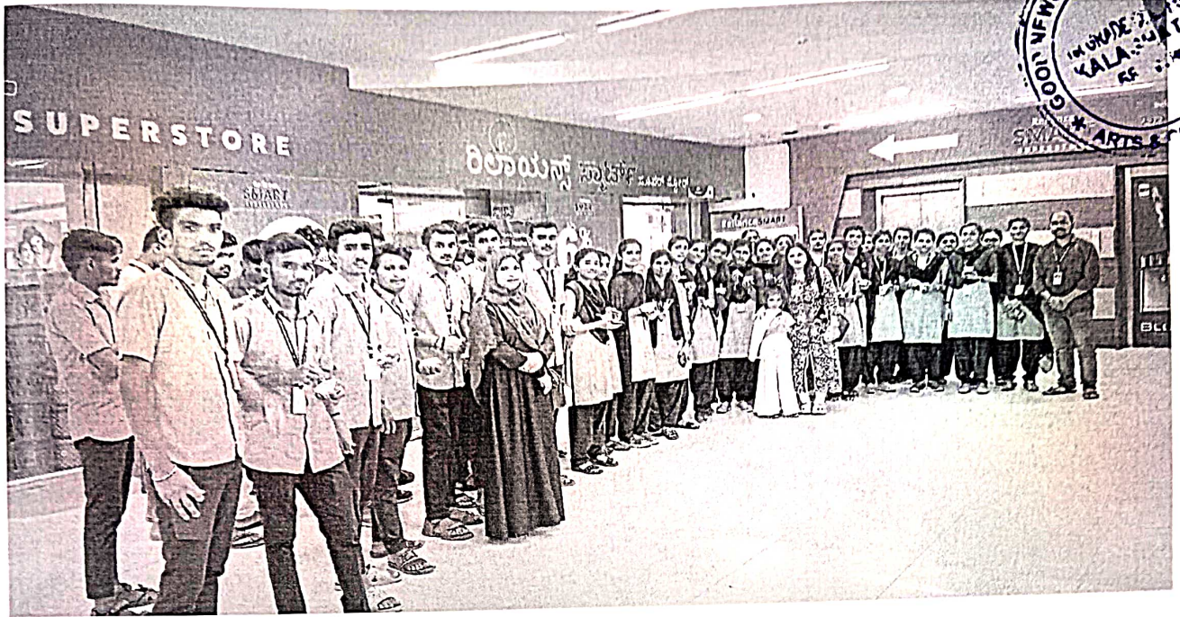
Inside of the Retail store