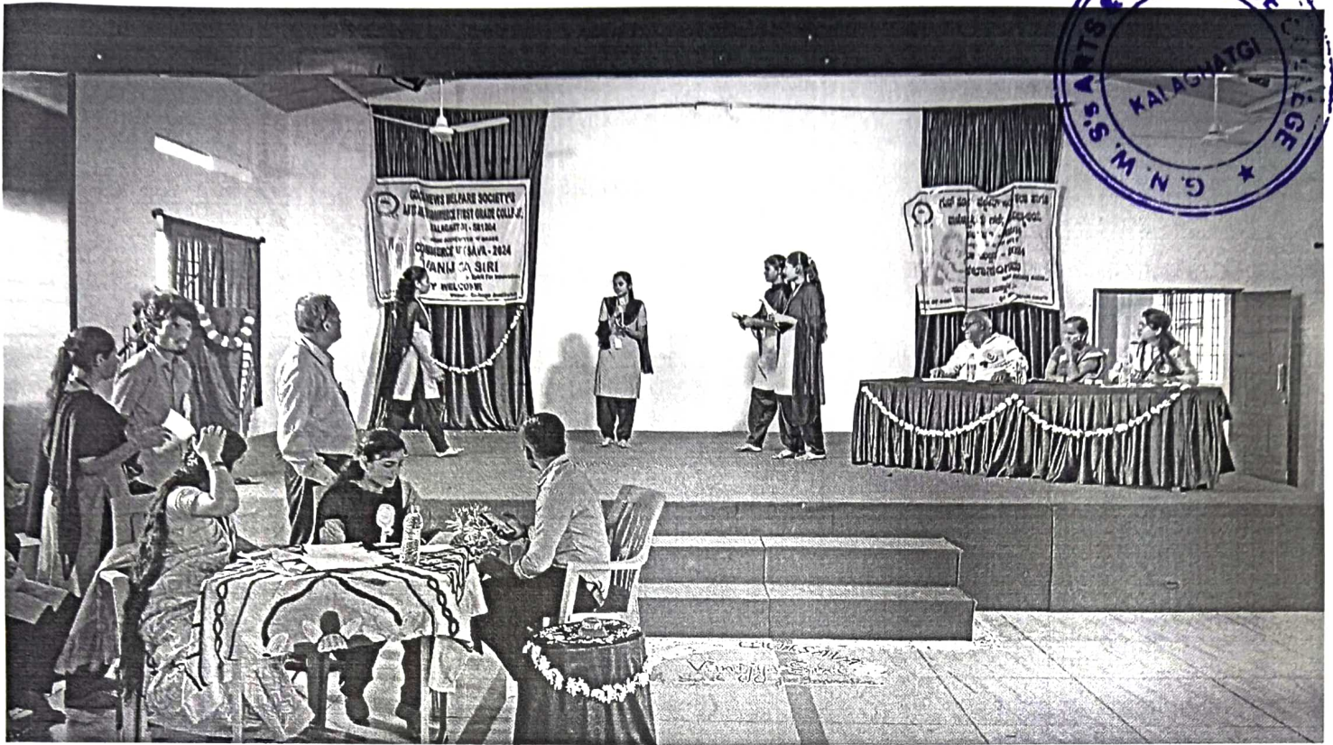
ADVERTISEMENT - PRESENTATION BY THE CONTENSTENTS