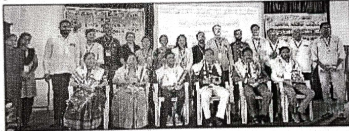
ಕಲಘಟಿಗೆ ಗುಡ್ ನ್ಯೂಸ್ ಕಾಲೇಜಿನಲ್ಲಿ ನಡೆದ ರಾಷ್ಟೀಯ ಮತದಾರರ ದಿನಾಚರಣೆ

ಪಟ್ಟಣದ ಗುಡ್ ನ್ಯೂಸ್ ಪದವಿ ಕಾಲೇಜಿನಲ್ಲಿ ಗುರುವಾರ ತಾಲೂಕು ಕಾನೂನು ಸೇವಾ ಸಮಿತಿ, ಕಲಘಟಿಗೆ ವಕೀಲರ ಸಂಘ, ಅಭಿಯೋಜನಾ ಇಲಾಖೆ, ಕಂದಾಯ ಇಲಾಖೆ, ಕಲಘಟಿಗೆ, ಪೊಲೀಸ್ ಇಲಾಖೆ ಹಾಗೂ