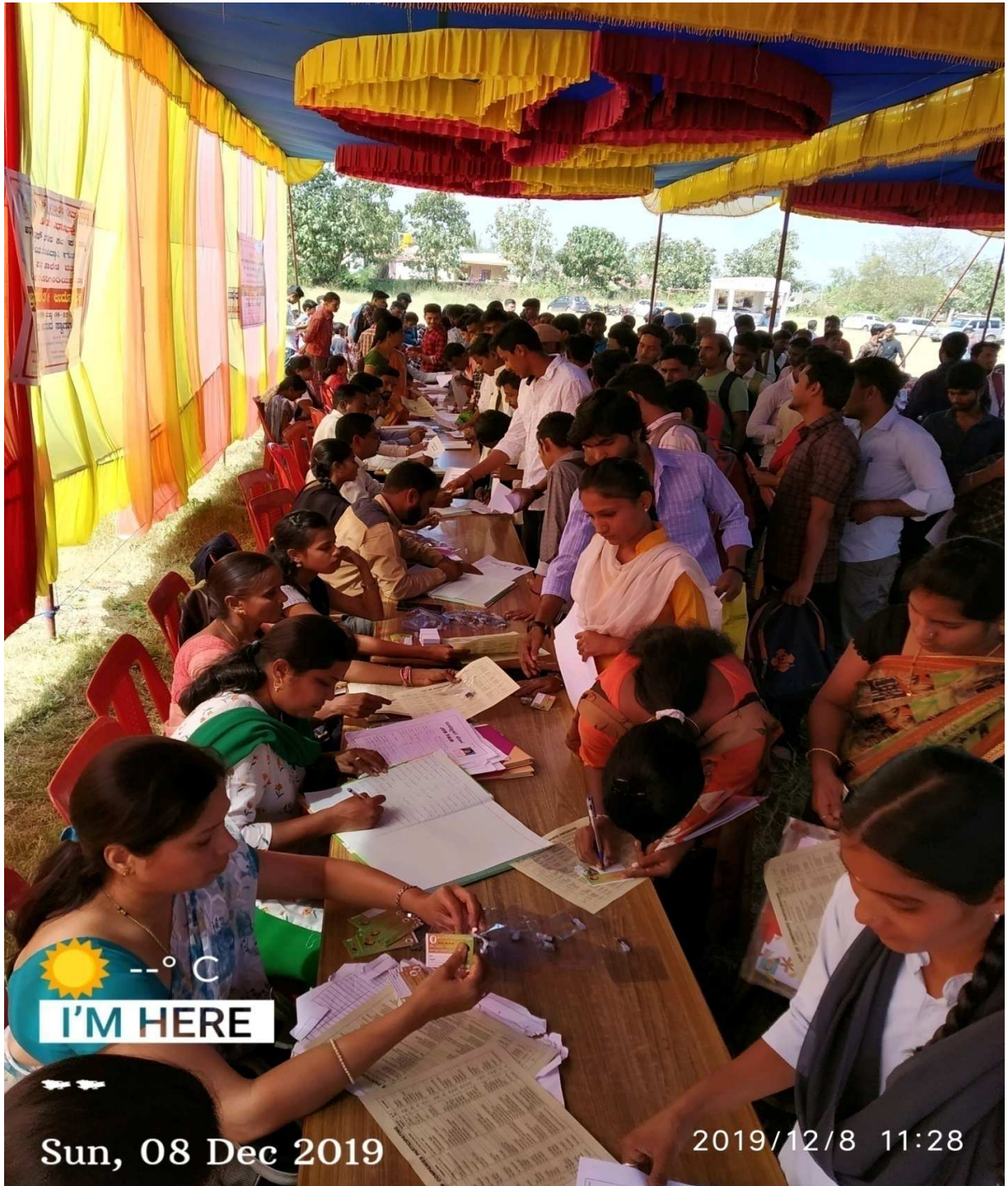
Job mela at our campus