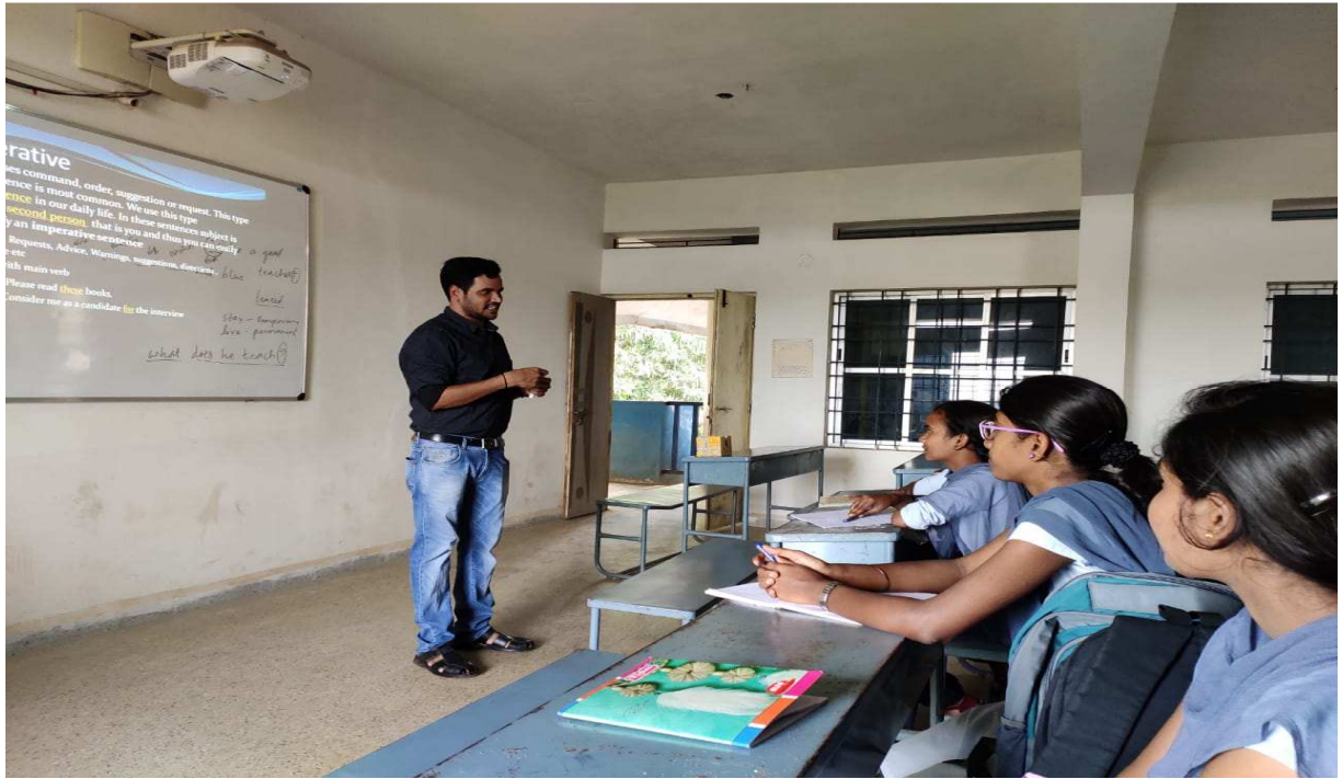
DOS IN COMMERCE GUEST LECTURE