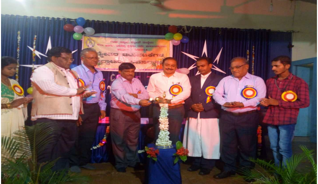
INNUAGARAL DAY CELEBRATION